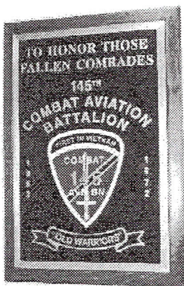
Typical plaque, designs vary