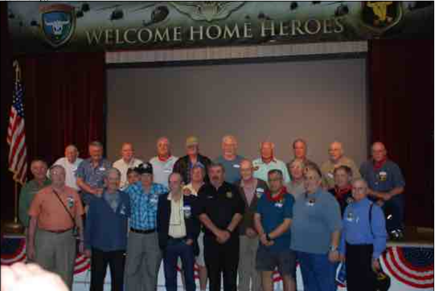
The Reunion members of the Battle of Easter Sunday. 50th. Anniversary held March 23rd. thru Sunday, the 26th. 50 years to the day. What an awesome group of Veterans.