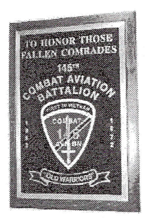
Typical plaque, designs vary